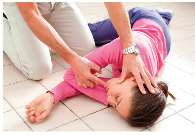
The recovery position