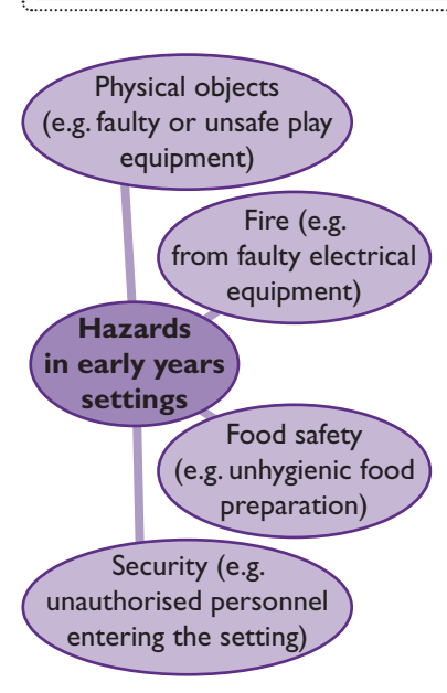
Figure 4.6 Hazards in early years settings

M3 Analyse the role of adults in early years settings in preventing accidents to babies and children, with examples.