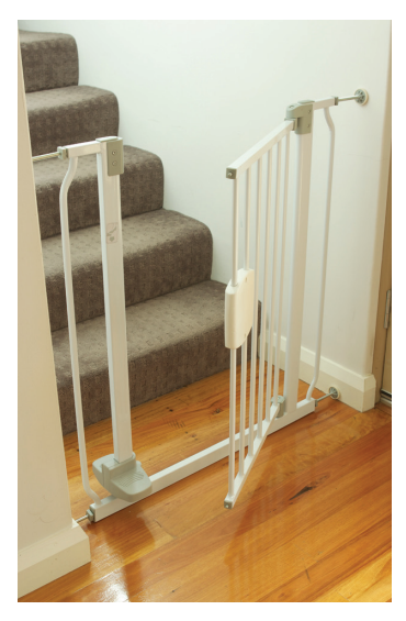
Make sure you use specialised safety equipment when necessary